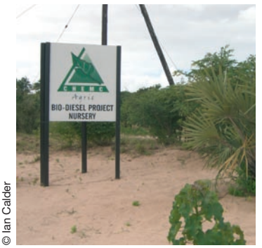
Jatropha plantation, India

Bioenergy is at the intersection of many policies and a broad range of political, economic, environmental and social interests